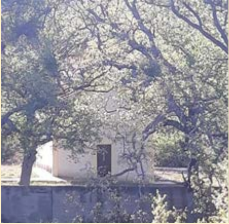
The Chapel is situated under walnuts and chestnuts. On the left the Holy Icon

On Easter Friday, on May 7 at the feast of Zoodochos Pigi , many village residents visited the Virgin Mary Chapel (Theotokos) at the border with Varvitsa village to attend the liturgy.