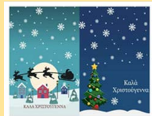
The Bod of the Karyates Association wishes to all the compatriots